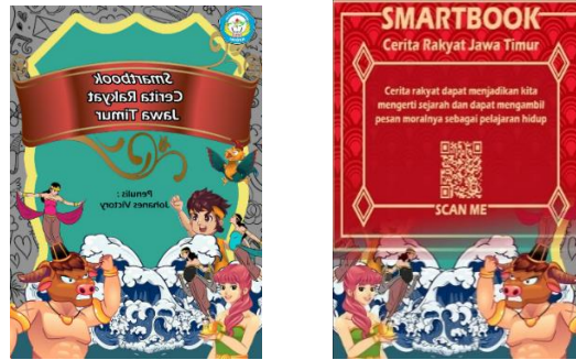
Image 1. Front and Back Cover View