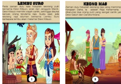
Image 4. Lembu and Keong Mas Story