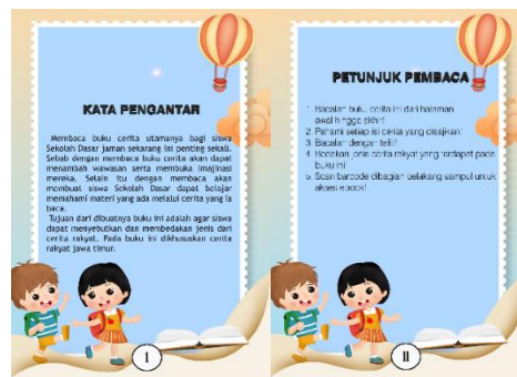
Image 2. Foreword and Instructions