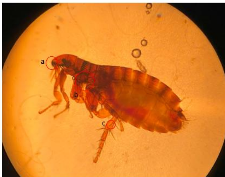
Figure 1. Flea Examination Results Ctenocephalides felis (4 x 10 magnification). *Note: a. The first and second genal ctenidium sisir; b. lateral metanotal area (LMA) bearing one or two setae; c. Notch.

The ectoparasite identified on fleas found in cats was Ctenocephalides felis . This identification was based on morphological characteristics, including an elongated and pointed head, hind legs longer than the forelegs, and the presence of genal ctenidia (combs). These findings are consistent with those reported by Ashwini et al., (2017) , who described C. felis as possessing a distinctly elongated and tapering head, with the metepisternum or lateral metanotal area (LMA) bearing one or two setae. The first and second combs (ctenidia) are of equal length; the genal ctenidium typically consists of 7–8 pairs of spines, while the pronotal ctenidium contains 15–16 spines. The head length is approximately twice its height. The dorsal margin of the hind tibia has six notches, with a single robust seta present at the fifth notch. Fleas measure approximately 1–2 mm in length and exhibit a bilaterally symmetrical, laterally flattened body shape ( Siagian & Fikri, 2019 ). These insects are wingless and possess three pairs of legs covered in fine setae, with the third pair significantly longer than the first two, enabling the fleas to jump from one host to another ( Wall & Shearer, 2021 ; Hadi & Soviana, 2010 ; Bashofi et al., 2015 ).